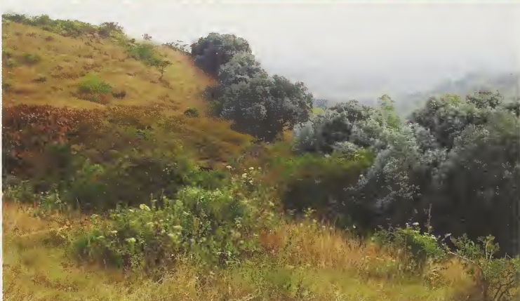
Figure 3. View of savanna woodlands, Rubona, Rwanda, July 2015 (B. Boedts) Vue sur la savane arborée, Rubona, Rwanda, juillet 2015 (B. Boedts)

Vue sur l'arboretum de Ruhande et, en avant-plan, les étangs piscicoles de Rwasave (à droite) et les rizières (à gauche), Huye, Rwanda, juillet 2015 (B. Boedts)